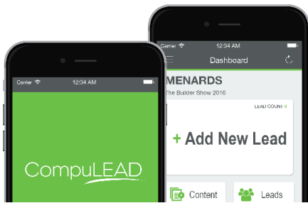
App works with all iPhone, iPad and Android devices with this year's and the previous year's operating system.