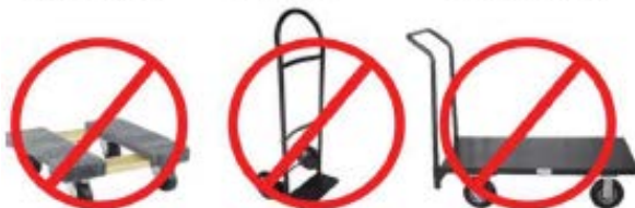
Four wheel push carts