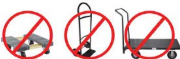
Four wheel push carts